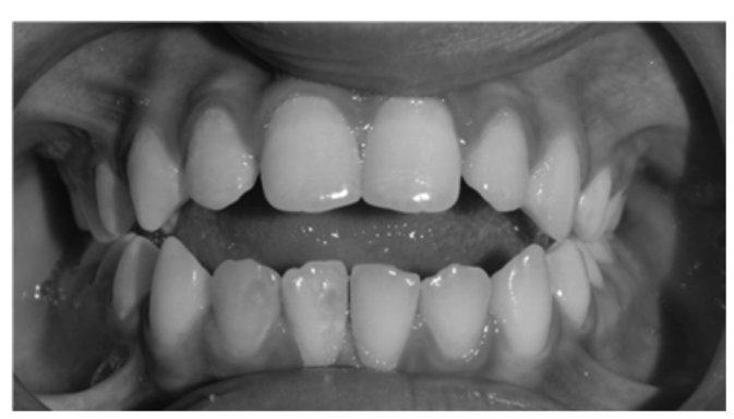
Fig 1: Patient with AOB.