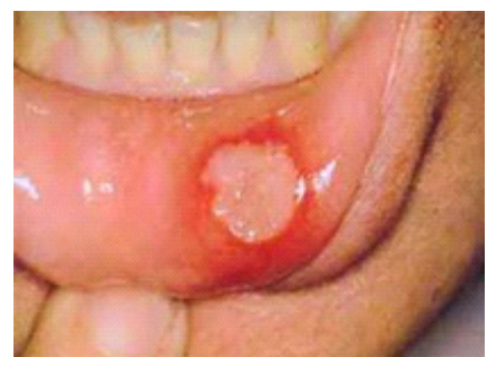
Fig 2: A aphthous ulcer on Labial mucosa with erythematous margins