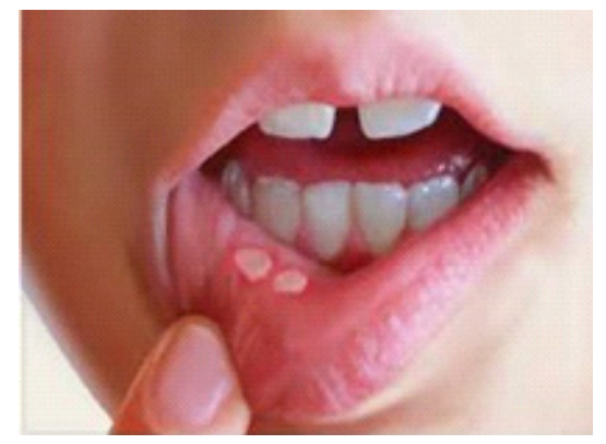
Fig 1: Multiple ulcers on right side of lower lip