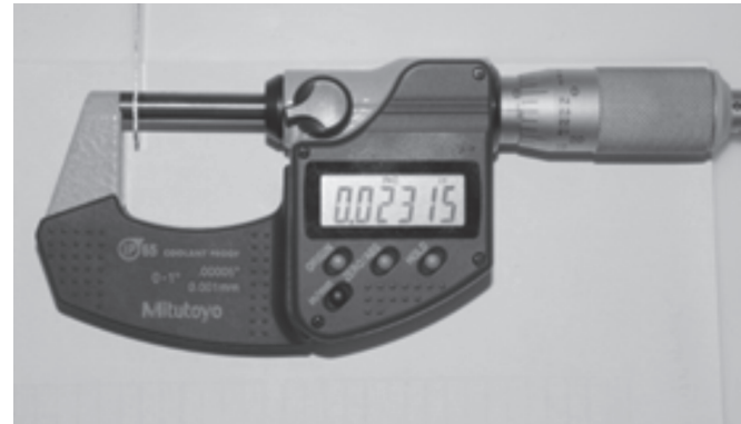
Figure 2: Micrometer to create digital readout of leaf gauges