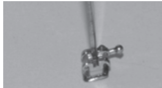
Figure 1: Leaf gauges used in the study

Expression of torque is the most challenging aspect in clinical orthodontics as it need interaction of larger dimensions rectangular or square wires within the bracket slot. It is difficult to insert full dimension wires in the slot and some free space or play is always pres-