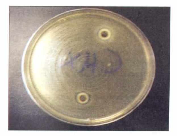
Fig. 1. MTA/CX group

of inhibition observed around the MTA/CHX mixtures compared with the MTA/water and MTA/ local anesthesia mixtures on all plates which was significantly different from other groups (P>0.05).