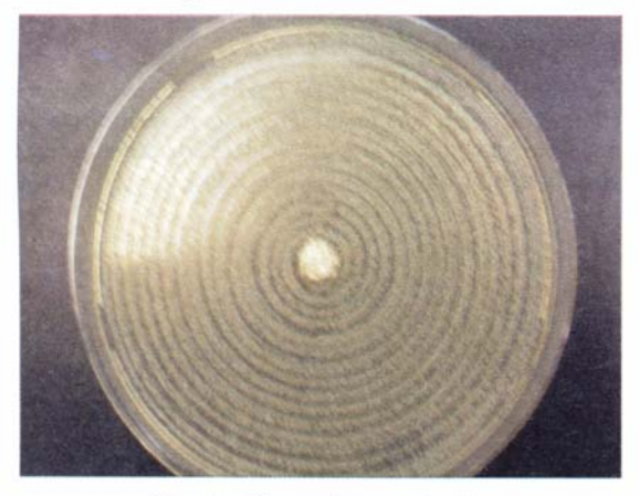
Fig. 5. Negative control