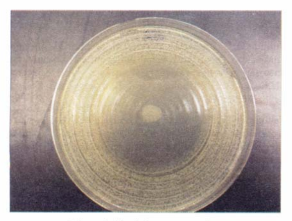
Fig. 4. Positive control