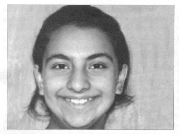
Fig 1a: Pretreatment poor smile