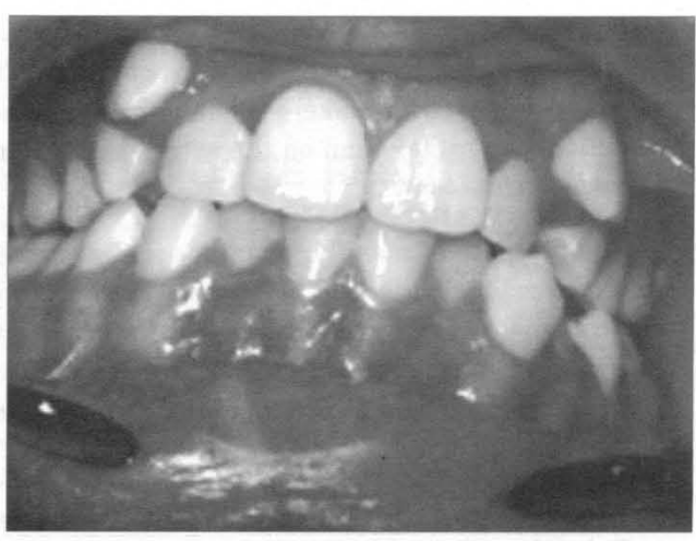
Fig 1b: Pretreatment occlusion