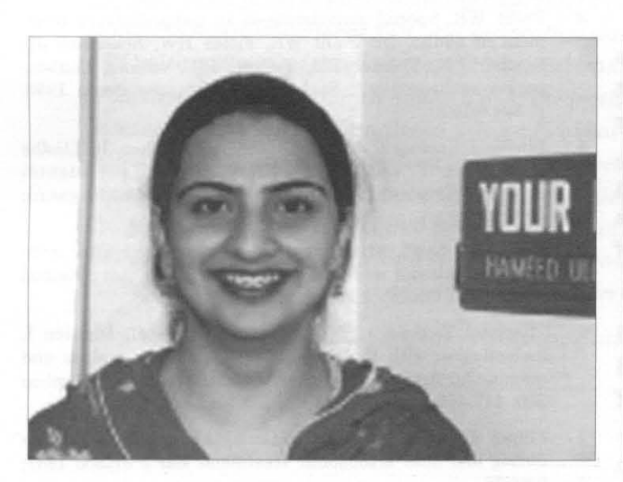
Fig 2a: Pretreatment smile