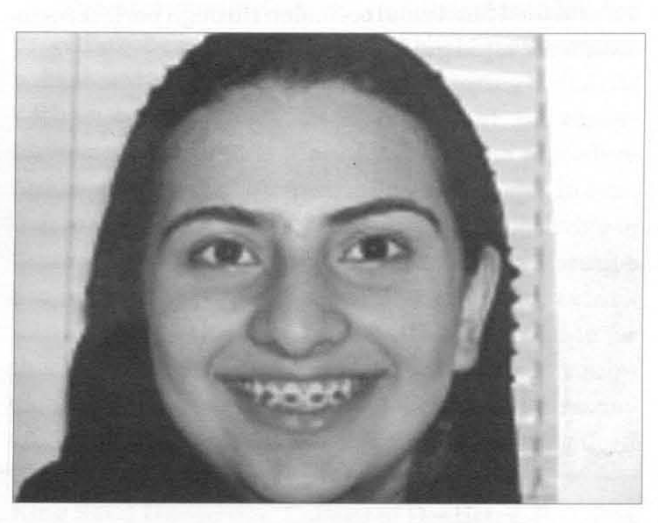
Fig 3: Post treatment radiant smile