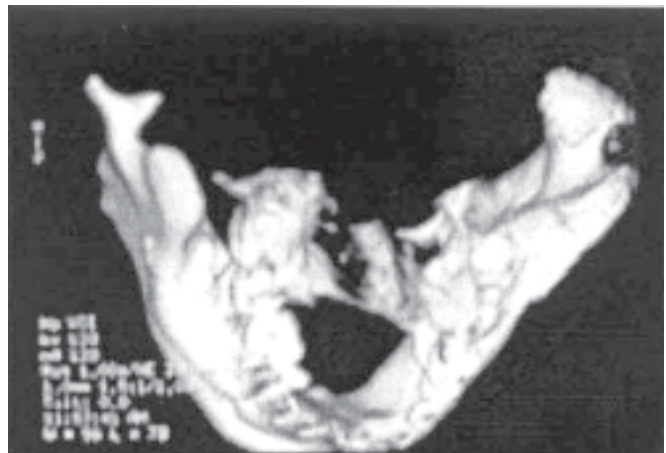
Fig 5: Three dimensional CT scan of mandible showing Y shaped appearance of right condyle

of duplication. Further investigation with axial and coronal spiral computed tomography (CT) confirmed the markedly deformed appearance of the right condyle and the significant asymmetry of the temporal fossae. The right condyle had a "Y-appearance", with 2 distinct medial and lateral heads. The medial head had a thin sclerotic margin and was within the glenoid fossa (Figs 3, 4, 5).