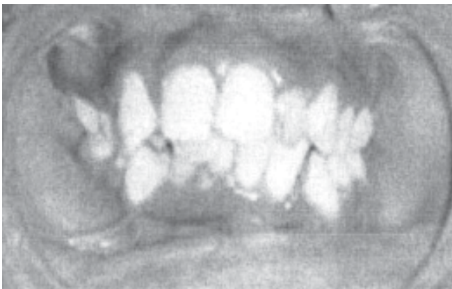
Fig 2: Intraoral examination showing crowding in the lower dental arch