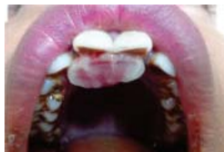
Fig 1: Solitary, exophytic, pedunculated lesion with interdental papilla on the palatal aspect of maxillary central incisors

Hemangiomas are common soft tissue tumors that are often congenital or develop in the neonatal period and grow rapidly. They usually cover a large site, may