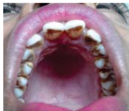
Fig 4: No recurrence after 1 month