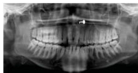
Fig 2: Panoramic radiograph showing multiple irregular calcified structures on left side over ramus of mandible.